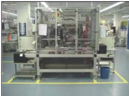
Fig. 2 Just a small part of the extensive, highly automated production facilities at Papst's St.Georgen factory

Production is very highly automated using state-of-the-art technology. This results in high product quality and efficient volume production.