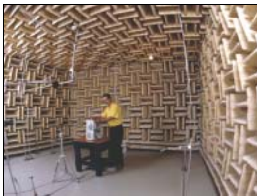
Fig. 3 Papst has a large anechoic room that is completely decoupled from the building and enables very low noise levels to be measured accurately

Papst continually develops new and improved products to meet the increasing demands from automotive manufacturers. It has extensive facilities. For R & D applications, a 16-channel PULSE system is extensively used with a variety of software including Sound Quality Type 7698.