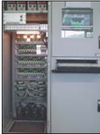
Fig. 4 One of Papst's test control stations at St.Georgen. Every fan is tested electrically and for vibration using a fully automated process