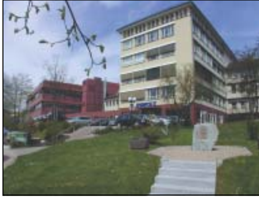
Fig. 1 Papst's headquarters at St.Georgen – a delightful town in beautiful surroundings

Papst focuses on the integration of independently functioning components and, in addition to air conditioning sensor fans, also manufactures a wide range of products for cooling electronics, small electric motors and actuators, etc. for the automotive industry. Papst ensures that delivery dates are strictly adhered to by holding large stocks at a number of strategically placed locations.