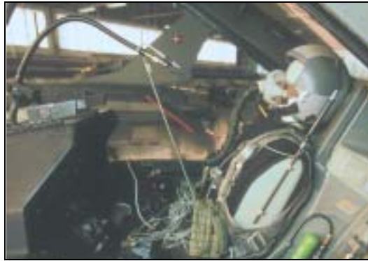
Fig. 1 HATS, complete with its customised "bone-dome", is installed in the rear seat of the F-16

With a Brüel & Kjær PULSE system and Head and Torso Simulator (HATS) strapped into the rear seat of an F-16/B, the goal of this airborne mission was to measure the noise that an F-16 pilot is exposed to during typical flight scenarios, and to determine the noise reduction provided by his helmet. Terma A/S, together with Ørsted DTU (Technical University of Denmark), and the Engineering College of Århus (ECA) have started a joint research project in the field of active noise reduction.