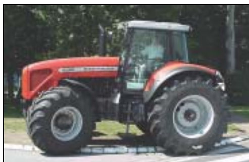
Fig. 6 Sébastien not only tests tractors – he also drives them. Here, he is moving a new tractor for testing to the NVH laboratory

Sébastien continues, “Our intention is to always be ahead of legislation and our competitors. Achieving a low whole body vibration exposure level on our tractors will be a major selling point. The data we collect from testing our tractors, and those of our competitors, will help us to optimise various components, for example, the front suspension, and the seat suspension, and make the whole tractor driving experience over a long period, more pleasant and less tiring”.