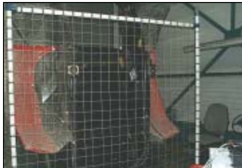
Fig. 5 Massey Ferguson uses sound intensity measurement techniques to develop effective noise reduction solutions

Sébastien explains, “We use sound intensity measurements extensively to develop cost effective noise reduction techniques, both in the R&D of new models, and improvements to current production tractors. The data helps us to design and specify acoustic materials, and where to place them in different areas of the tractor so that noise in the tractor cabin is reduced. We can test large structures and have designed and built our own large grid matrix.”