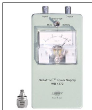
Fig. 2 DeltaTron Accelerometer Type 4514-002 and DeltaTron Power Supply WB 1372

In his latest project, Jacob travelled to Iceland and stumbled across the sonically rich wastelands around Krisuvik, which bubble and explode with volcanic activity. Equipped with a general purpose DeltaTron ® Accelerometer Type 4514-002 in his bag, Jacob mounted the accelerometer on a sharp-tipped probe and dived in to have a listen. With its titanium housing and unique design, Type 4514-002 provides high seismic resonance and ruggedness, and is capable of operating at extreme temperatures. Powered by DeltaTron Power Supply WB 1372, the accelerometer converted the geothermal vibrations to electronic signals as the earth heaved, constricted, bubbled and spewed, and Jacob recorded every rumble, rattle, murmur and roar transmitted through the accelerometer.