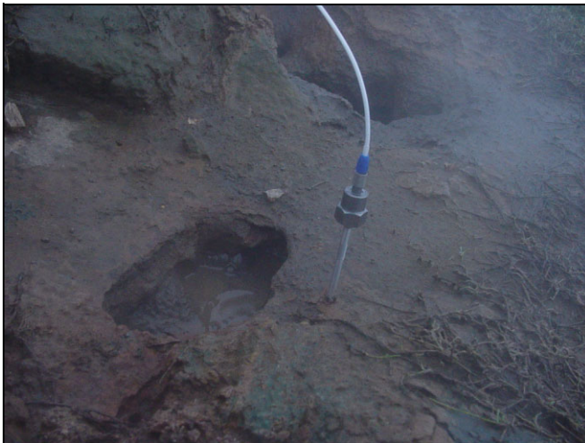
Fig. 4 a) The accelerometer was mounted on a probe, which was inserted in the ground. b) Jacob on a sound excavation within the volcanic fields around Krisuvik, Iceland

“The earth has an incredibly interesting sound, because there is such a large spectrum in it, with the deep warm tones, high frequencies on top and a movement that gives associations to rhythm and music – it is ideal for playing at home or performing at concerts.” A statement that Jacob meant quite literally. In 2004, he released a music CD with recordings from the expedition. The unmanipulated sound tracks may not be what most people would consider dance music, but the pure sounds and high