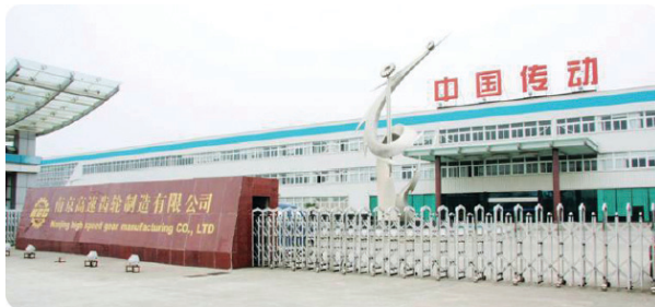
Fig. 1 NGC mainly produces wind turbine gearboxes. The plant covers an area of 258 acres (172 000 m 2 ) and annual production is approximately 4000 MW

The company has a 80% market share of the Chinese wind transmission equipment market and customers include GE Energy, Vestas, Repower, Nordex, Goldwind Science and Technology Co., Ltd., Dongfang Steam Turbine Works, Shanghai Electric Group Co., Ltd., and Sinovel.