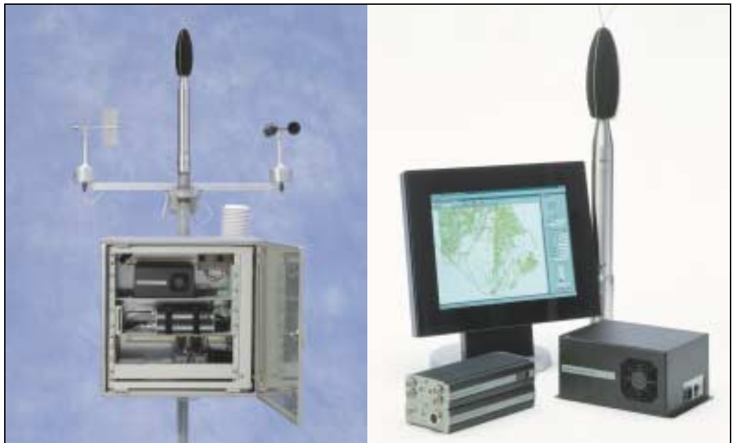
Fig. 1 Noise Monitoring Terminal with weather-station option (left); and Microphone Unit, Power Supply, Noise-level Analyzer and System Controller (right)

An NMT consists of a noise-level analyzer, a weatherproof microphone, a system controller and a power supply, all mounted in a weatherproof cabinet with a climatic unit that maintains the internal temperature within the working range of the equipment. Correlated noise monitoring – where noise events are correlated with flight-tracking data as well as weather and demographic data – can be used as an integral part of a comprehensive, environmental monitoring policy, creating a more environmentally aware, and ‘greener’ airport environment.