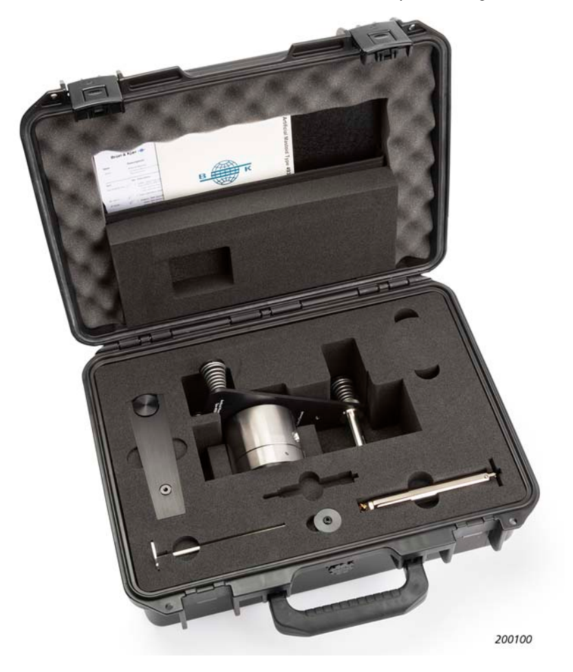
Fig. 3 The artificial mastoid shown disassembled in the transport case

The artificial mastoid needs to be disassembled for transport, see Fig. 3: