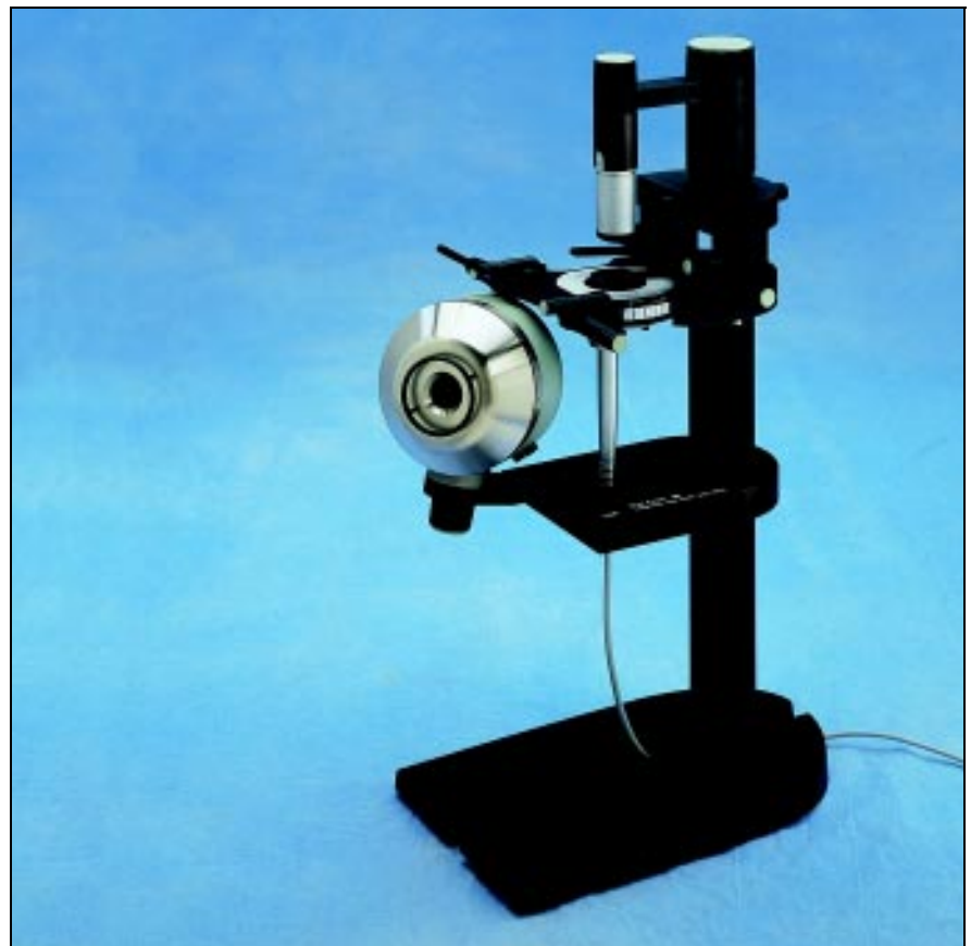
Fig.1 Telephone Test Head Type 4602 B shown with Mouth Simulator Type 4227, in LRGP modal position, and Ear Simulator for Telephonometry Type 4195 (both must be ordered separately)

Telephone Test Head Type 4602 B allows accurate and repeatable positioning and subsequent measurement of a telephone handset in the standardized LRGP, HATS and AEN positions as recommended by the ITU-T, as well as in the REF position (OREM A). It is used as a general test jig with other Brüel & Kjær measurement equipment. Type 4602 B has been updated to accommodate handsets with antennas. An upgrade kit is available for updating earlier Test Heads Type 4602.