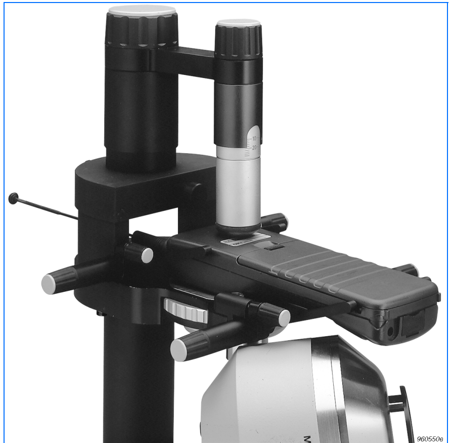
Fig.2 Telephone Test Head Type 4602B allows positioning of almost all telephones. The redesigned structure has room for mobile telephone antennas and batteries. The Test Head is supplied with extra alignment rods that allow non-symmetrical handsets to be positioned accurately and reliable

The new Type 4602B test head provides more space and adjustment range to allow for the new generation of slim handsets as well as the thick