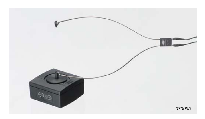
Fig. 3 Calibration of Type 4101-A using Adaptor DP-0978 and Sound Calibrator Type 4231

Level calibration of the binaural microphone when in use, is performed using the special calibration adaptor together with Sound Calibrator Type 4231. Using the adaptor, the output level from the calibrator will be increased by 0.35\,\mathrm{dB}\pm0.2\,\mathrm{dB} .