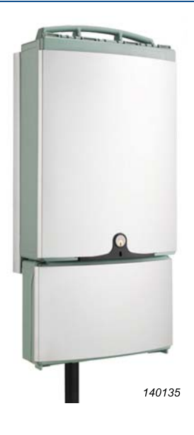
Fig. 4 Noise Monitoring Terminal Type 3639-E/ G – the electronics inside the NMT are well protected

The NMT has been specifically designed to operate unattended in inhospitable environments, protecting the contents from weather and unwanted interruptions due to tampering, vandalism, theft, etc.