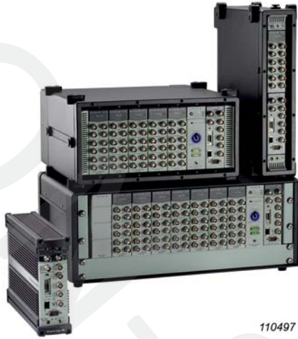
Fig. 3 PULSE Front-end Driver Types 3099-A-X 3099-A-X1 or 3099-A-X2 allow Brüel & Kjær's PULSE data acquisition software to acquire data from the IDA e family of hardware

The IDA e family of data acquisition hardware continues to provide users with versatile, task-oriented systems for noise and vibration analysis with up to 96 channels using Type 3560-E frames.