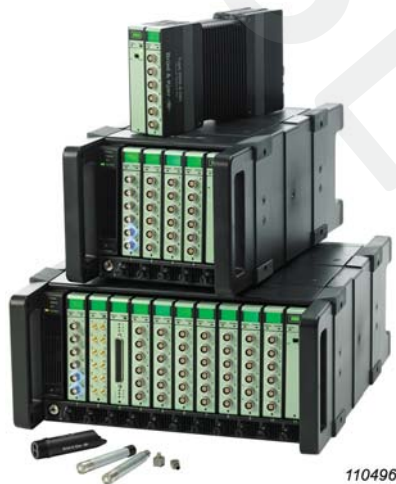
Fig. 2 PULSE LAN-XI Front-end Driver Types 3099-A-X, 3099-A-X1 and 3099-A-X2 allow Brüel & Kjær's PULSE data acquisition software to acquire data from the LAN-XI family of hardware

The modular nature of LAN-XI hardware and front-end drivers provides the maximum flexibility. The same system can be, for example, either one 18-channel system for large measurements or three 6-channel systems for routine measurements.