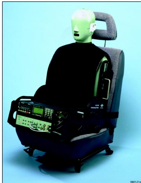
Fig. 2 Head and Torso Simulator Type 4100 situated in a Positioning Frame UA 1324 with Sound Quality Conditioning Amplifier Type 2672 and a SONY DAT recorder

A head and torso simulator allows you to make binaural recordings that sound realistic and include all the directional clues. When played back using headphones, recordings sound as they would if you were present instead of the head and torso. The acoustics of the test environment are faithfully reproduced and, because directional information is accurately recorded, you can, when listening, distinguish a number of sound sources from each other. In many cases,