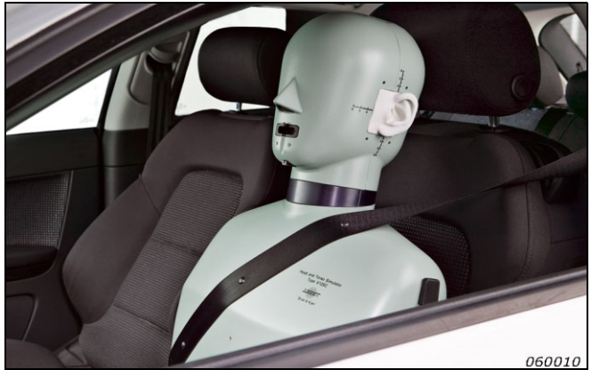
Fig. 1 The Head and Torso Simulator (HATS) and the PULSE analyzer platform from Brüel & Kjær constitute a solid foundation for testing hands-free equipment in-car. Both VDA specific tests and other relevant electroacoustic tests on separate microphones or loudspeakers can be performed

Measurements on hands-free equipment as well as its individual components can easily be performed using the PULSE data acquisition and analyzer platform equipped with the proper hardware and software options.