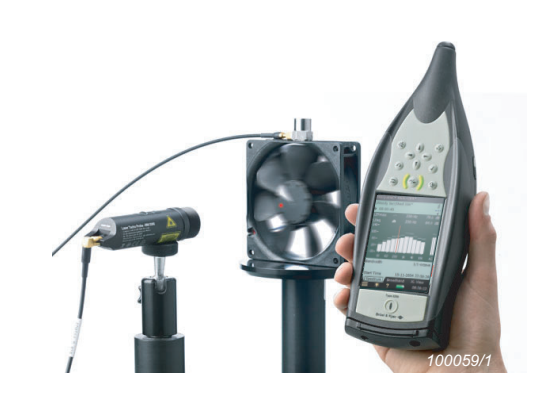
Fig. 3 Type 2981 with Integrating Hand-held Vibration AnalyzerType 2250-V for product vibration testing

The probe should be angled so that its visible laser dot faces the test object to which a small strip of self-adhesive reflective tape has been attached. The retroreflective tape backscatters the laser energy to the receiver. Backscattering the light allows the probe to be more than 30° from perpendicular to the measurement surface.