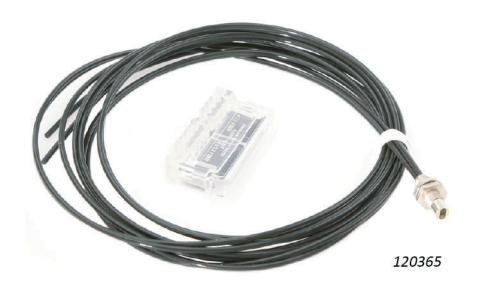
Fig. 4 AE-4003-D-020 is 2 m in length but comes with a precision cutting tool to reduce light losses from non-perpendicular cuts

AE-4003-D-020 is 2 metres long (6' 6") and allows Type 2981 to be placed in a relatively cool location (for example behind a car's