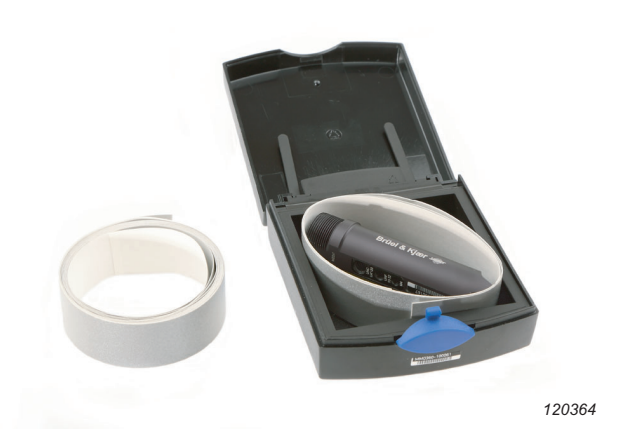
Fig. 1 Type 2981 includes 4 m of retroreflective tape and a storage box

It is possible to use Type 2981 with a standard CCLD supply. The low rpm limit of the system will be the high-pass frequency of the CCLD power supply rather than zero. Bias voltage and signal amplitude are almost completely unaffected by rpm and distance to the object and are also independent of CCLD current