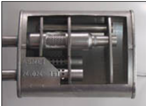
Fig. 11 Many of ASMET's exhaust systems use advanced construction methods to achieve excellent noise reduction characteristics