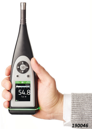
Fig. 2 The sound level meter's lightweight design and user-friendly display

B&K 2245 provides effortless usability with a dust- and water-resistant body that is rubberized for a more secure grip and ensured compliance to IP 55. The seven control buttons can be comfortably operated with one hand, and the clear, bright display shows you the most important information at a single glance. With a 13-hour battery life, you can be sure it will not let you down.