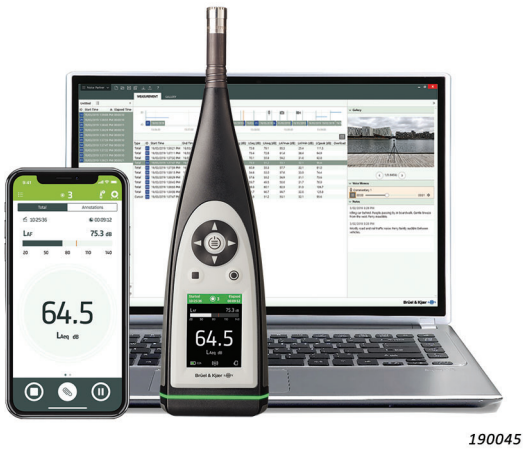
Fig. 1 The complete solution: B&K 2245 Sound Level Meter and the Noise Partner app installed on a mobile device and PC

B&K 2245 Sound Level Meter is a complete package solution that includes the Noise Partner app for both mobile measurement control, display and data transfer and as a PC-based application for analysis and documentation.