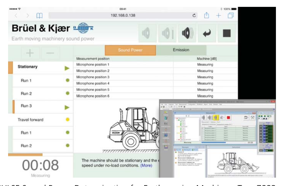
Typical System for PULSE Sound Power Determination for Earth-moving Machinery Type 7883

A typical system for the determination of sound power under dynamic conditions and emission sound pressure level at the operator's level under dynamic conditions (ISO 6395 and ISO 6396, respectively) consists of a ground station and an in-vehicle station, see Fig. 4.