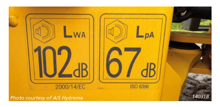
Fig. 1 Noise labels on a backhoe loader

PULSE Sound Power Determination for Earth-moving Machinery Type 7883 is the key software component to your sound power determination system. Type 7883 supports all equipment necessary to fulfil each standard, from basic to comprehensive systems.