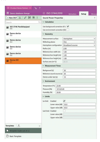
Fig. 2 Measurement properties that can be used once or saved as a template for future tests

Perform Guided Measurements via Mobile Device or PC With a test or test template in hand, the test operator can then go step by step through a measurement using either the PC software or via a mobile device with the Product Noise Partner app downloaded.