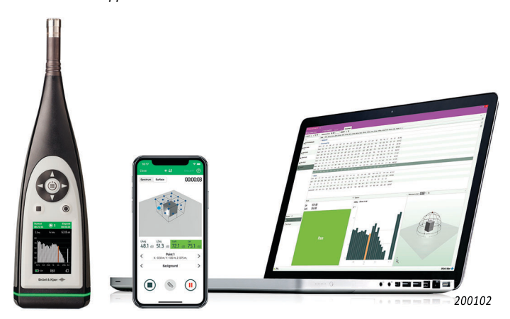
Fig. 1 The complete solution: B&K 2245 Sound Level Meter and the Product Noise Partner app installed on a mobile device and PC

This means there are no licence files to install on the PC, and no dongles. Mobile and desktop apps can be freely downloaded and installed on any supported iOS mobile device and PC, and measurements made with the instrument can be easily and seamlessly edited by the desktop app on a PC without extra requirements.