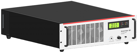
LDS LPA1000 Amplifier

The LPA1000 has been designed to provide optimum, efficient, and reliable system power. Benefitting from low noise circuitry, advanced field proven Class B topology and a low distortion design.