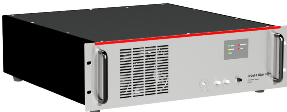
LDS FPS Field Power Supply

The FPS field power supply is designed to provide the dc power requirements of the field and degauss coil for the following LDS shakers: V555 Series, V650 Series, and V721 Series, and to operate with the LPA1000 amplifier.