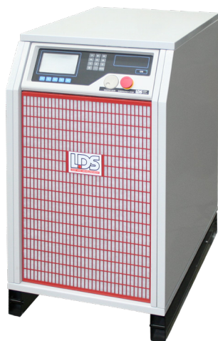
LDS HPAK Amplifier

The HPAK amplifier is a dedicated 5 kVA unit optimised for use with the LDS V650 Series and V780 Series shakers to deliver greater force than if using the LPA1000 amplifier. This compact unit delivers the power for both the shaker and field coils, as well as power for the cooling fan.