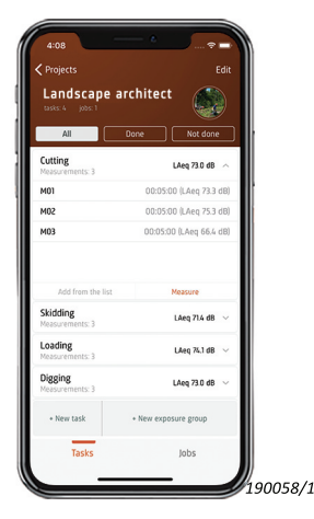
Fig. 3 For each project you set up, you can define the tasks, exposure groups and test standard and easily manage project status

The intuitive mobile app guides you through the steps of a survey, including calculating the workday noise exposure level. This means you never have to remember complex processes and your results will comply with regulatory requirements.