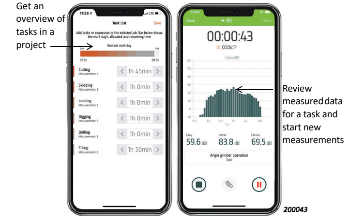
Fig. 2 Control and view measurements directly from your mobile device

seamlessly edited by the desktop app on a PC without extra requirements.